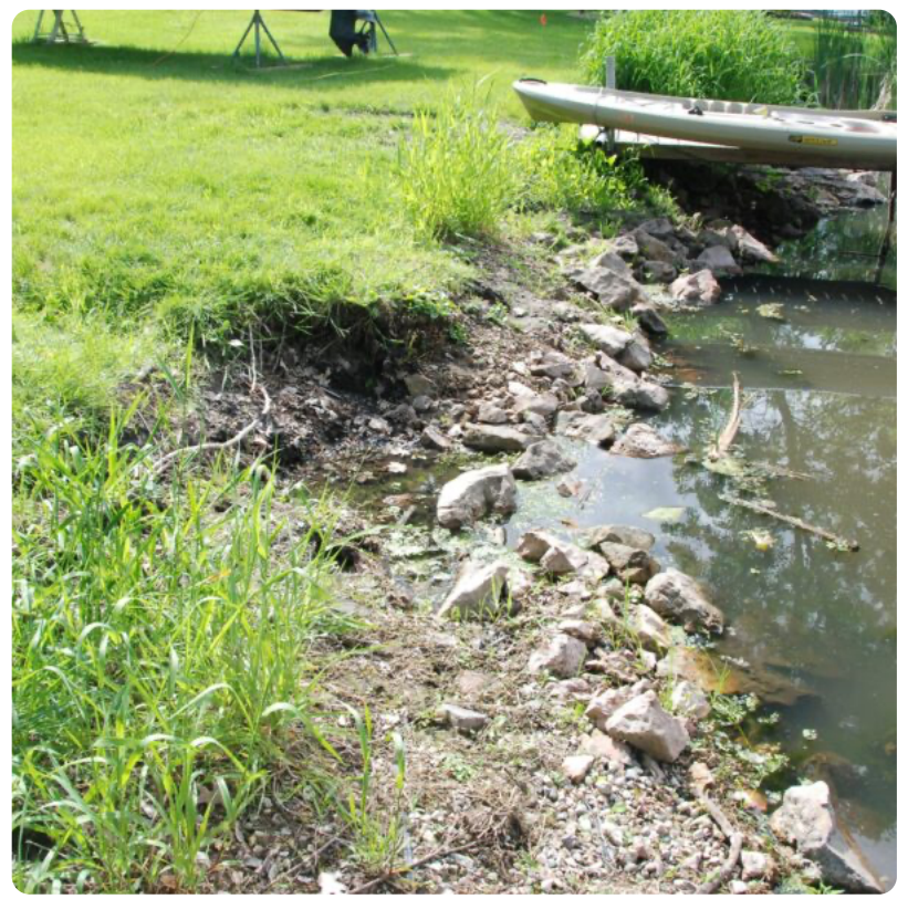
Eroded Shoreline Before Restoration

Lakeshores are subject to a variety of erosion-causing factors, such as natural wave action, boat wakes, flooding, ice-heaves, muskrats, and foot traffic. Lakeshores throughout Minnesota, have been stripped of native vegetation in favor of the clean looking turf grass. From a soil stabilization standpoint, this is a horrible transition. You see, traditional turf lawns have shallow root systems, averaging 2" in depth, and cannot withstand even moderate wave action. Over time, the shores experience soil loss and cut bank (steep drops) formation. Soil particles end up in the lake and can cause "turbidity" or cloudy, brown tinted water. On a large scale, this can become a serious water quality concern.