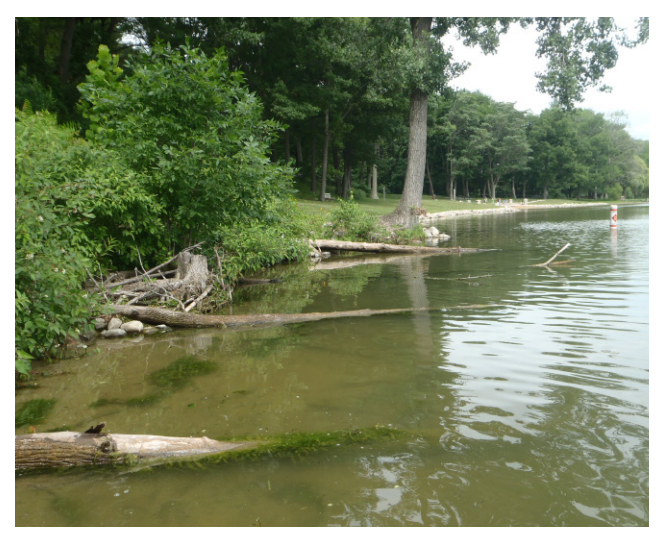
Coarse woody structure project installed as part of the Michigan Natural Shoreline Partnership Certified Natural Shoreline Professional (CNSP) Training.

Restore shoreline woody structure to the nearshore area of your lake. Root wads, logs, and whole trees can be installed as shoreline woody structure, but don't use trees that are currently growing near the shoreline, because they are stabilizing it from erosion. It is best to use recently live trees. The structure must be securely anchored. EGLE recommends placing woody structure 100 feet away from docks, boat ramps, and designated swimming areas. Below is one installation strategy that uses posts and cable to anchor trees to the shoreline.